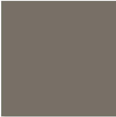
IRON | 1012